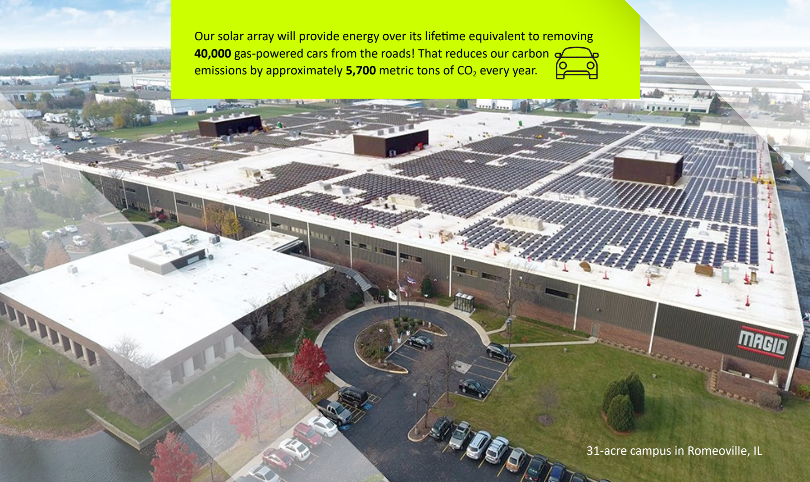
31-acre campus in Romeoville, IL